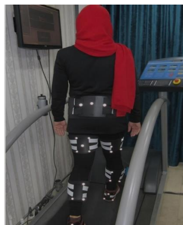
Figure 1. A participant performing the walking task on the treadmill

After assuming a standard anatomical standing position, participants walked on the Hp Cosmos Mercury treadmill (Germany) at their predetermined preferred speed. Data collection was performed under steady-state conditions for a minimum of 30 seconds to capture at least 10 complete gait cycles. To ensure data reliability and availability, the testing procedure was repeated three times with a one-minute rest interval between trials. (Figure 1)